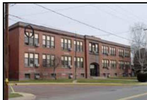
Orange Street Elementary School

All kindergarten through fifth grade elementary students use the SuccessMaker program. A Windows platform is used at all SuccessMaker workstations. Every elementary student spends 15 minutes, four days each week on the math program with the fifth day being utilized for remediation and enrichment. The SuccessMaker reading programs are provided to students twice per week.