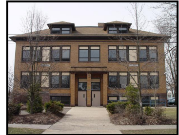
14 th Street Elementary School